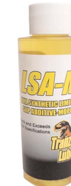
LSA-M Limited Slip Additive for Mopars

A full synthetic lubricant recommended for 4WD vehicles with automatic transfer cases. Provides extremely high oxidation resistance for extended drain intervals. Meets or exceeds OEM specifications. Replaces N°12378508.