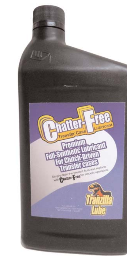
CHATTER-FREE Synthetic Transfer Case Lubricant

A custom-blended lubricant developed specifically for precision-built Tranzilla® synchronesh transmissions.