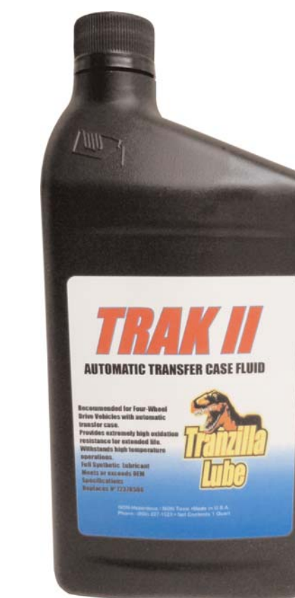
TRAK II Automatic Transfer Case Fluid

Formulated with synthetic base stocks and special proprietary additives this transmission fluid replaces N°Mopar 5013457AA or MS-9602.