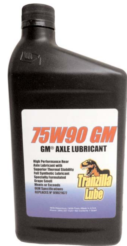
75W90 GM Axle Lubricant

A full synthetic, high-performance rear axle lubricant that doesn't break down at elevated temperatures. It meets or exceeds OEM specifications. Replaces 89021677