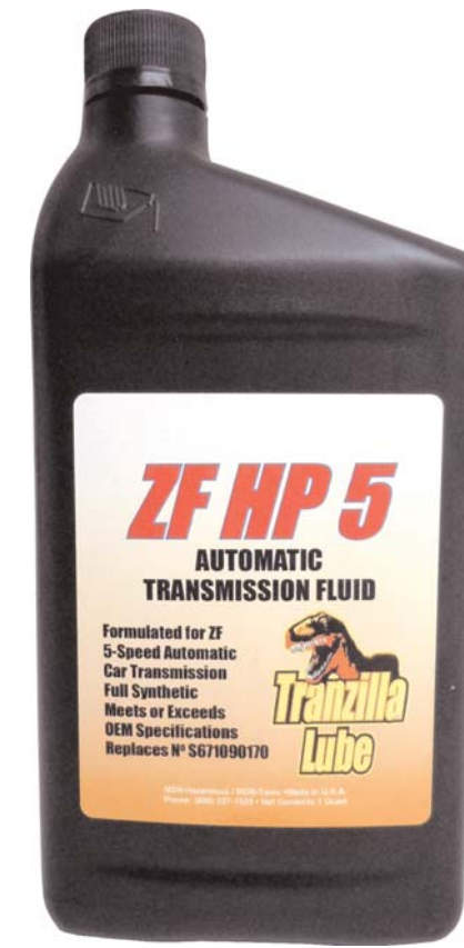
ZF HP 5 Synthetic Automatic Transmission Fluid

A full synthetic, multi-viscosity axle lubricant for Fords recommended for heavy duty applications. Meets or exceeds OEM specifications. Replaces XY-75W140-QL