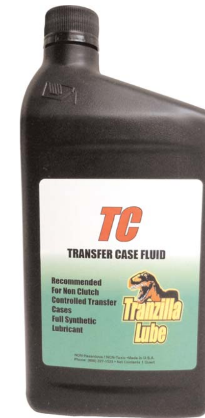
TC Synthetic Transfer Case Fluid

A premium synthetic manual transmission fluid developed to withstand extreme high and low temperatures. Meets or exceeds OEM requirements for most synchronesh transmissions. Replaces 12345349