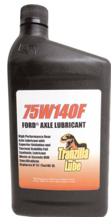
75W140F Synthetic Axle Lubricant for Fords

Formulated to reduce or eliminate chatter in clutch-driven transfer cases, Chatter-Free is a full-synthetic lubricant that will smooth out transfer case operation.