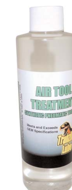
Air Tool Treatment

Tranzilla® Lube is one of the few true synthetic assembly lubes on the market. It provides superior lubrication during those critical break-in/run-in periods.