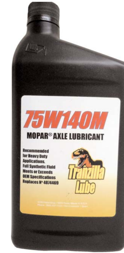
75W140M Axle Lubricant for Mopars

A full synthetic lubricant formulated for differentials and manual transmission gearboxes. Meets or exceeds OEM specifications. Replaces 12346190