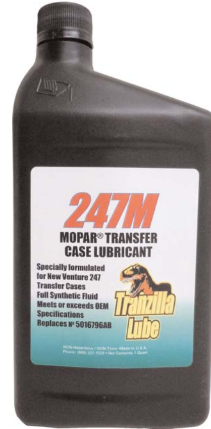
247M Transfer Case Lubricant for Mopars

A full synthetic, high-performance rear axle lubricant that doesn't break down at elevated temperatures. It meets or exceeds OEM specifications. Replaces 89021677