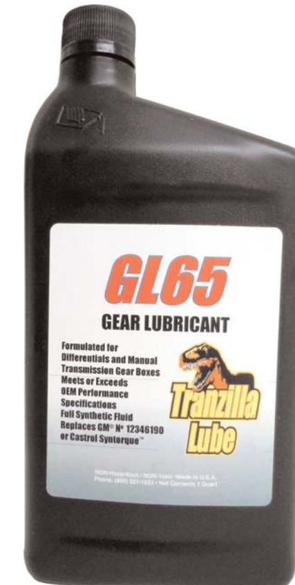
GL65 Synthetic Gear Lubricant

A full synthetic transfer case lubricant for New Venture 247 transfer cases. Meets or exceeds OEM specifications. Replaces 5016796AB