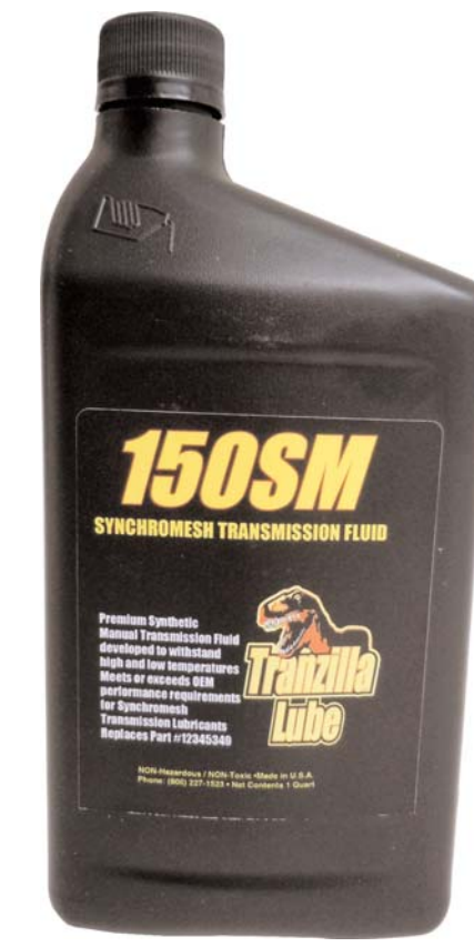
150SM Synthetic Synchronesh Transmission Fluid

Formulated specifically for ZF 5-speed automatic car transmissions. Meets or Exceeds OEM Specifications. Replaces S671090170